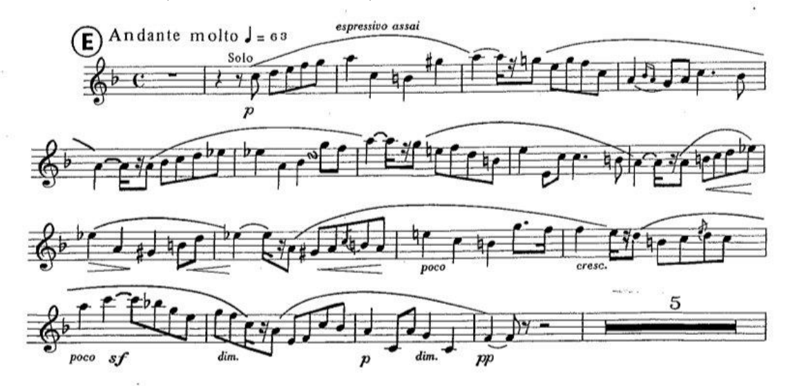
2a) Shostakovich, Festive Overture – excerpt #1